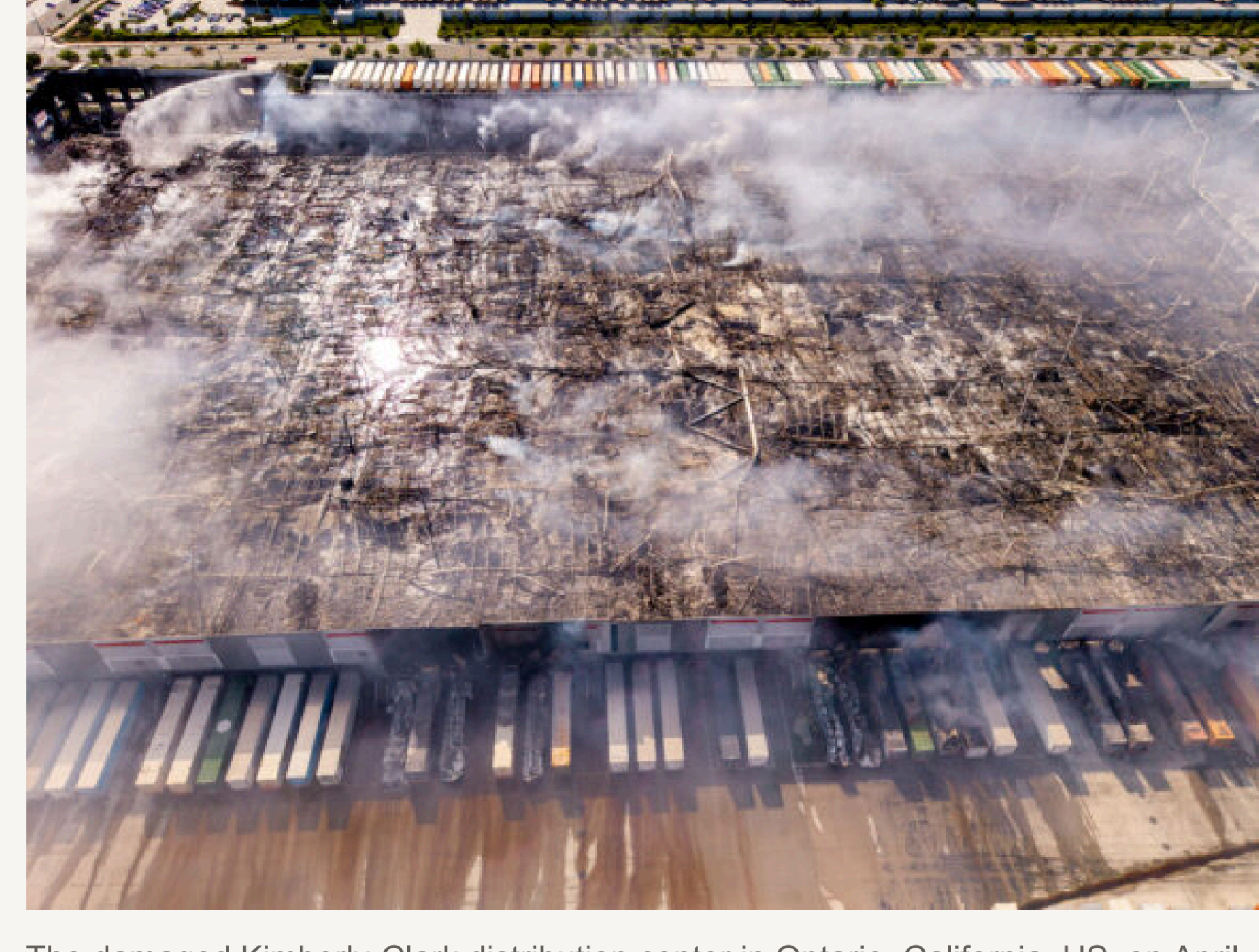
The damaged Kimberly-Clark distribution center in Ontario, California, US, on April 7.

Photos from the scene showed the entire building engulfed in flames. The blaze reached a six-alarm response, involving around 175 firefighters, the Ontario Fire Department said.