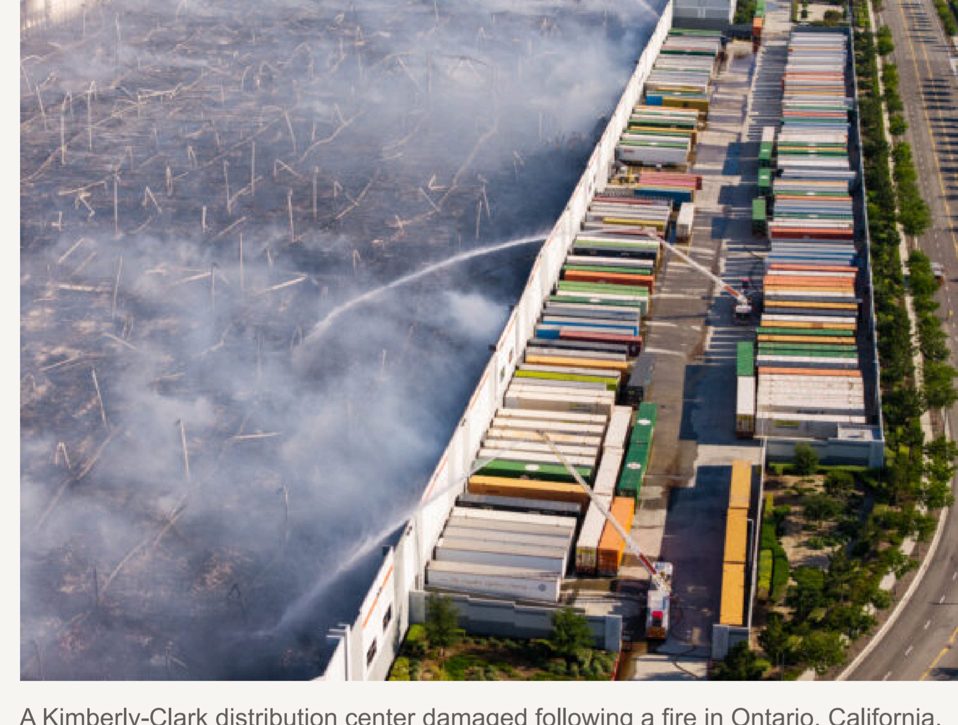
A Kimberly-Clark distribution center damaged following a fire in Ontario, California, US, on Tuesday, April 7, 2026. A Kimberly-Clark Corp. employee has been arrested on arson charges after a massive fire broke out Tuesday morning at a California distribution center that serves around 50 million people.

"This fire was suspicious in nature from the initial stages," Wedell told Bloomberg earlier.